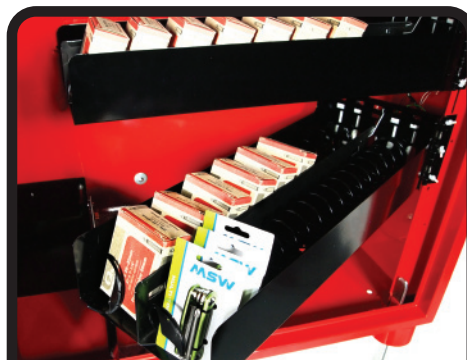
Easy to refill product